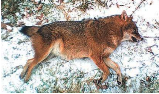
Fig. 1. Golden jackal killed by hunters in December, 2009 on the border between Khmelnytsky Reg. (vil. Novokostiantyniv) and Vinnytsia Reg. (vil. Osichok).

Рис. 1. Шакал, здобутий мисливцями у грудні 2009 р. на межі Хмельницької (с. Новокосянтинів) та Вінницької областей (с. Осічок).