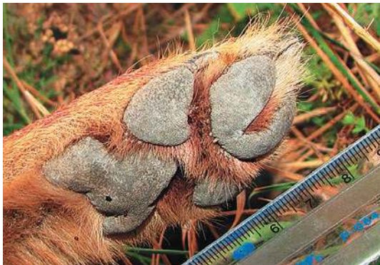
Fig. 2. Connate pads of the medial toes on the jackal's forelimb from the Donetsk Reg.

Рис. 1. Шакал, здобутий мисливцями у грудні 2009 р. на межі Хмельницької (с. Новокосянтинів) та Вінницької областей (с. Осічок). 13.12.2012.