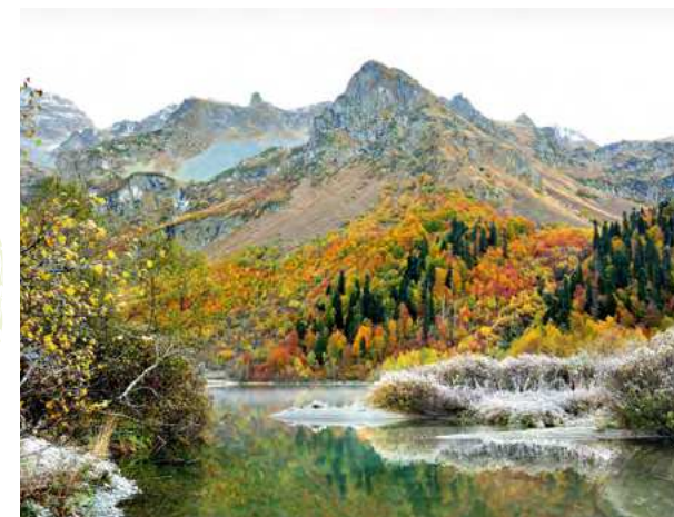
Author photo: O. Komissarov