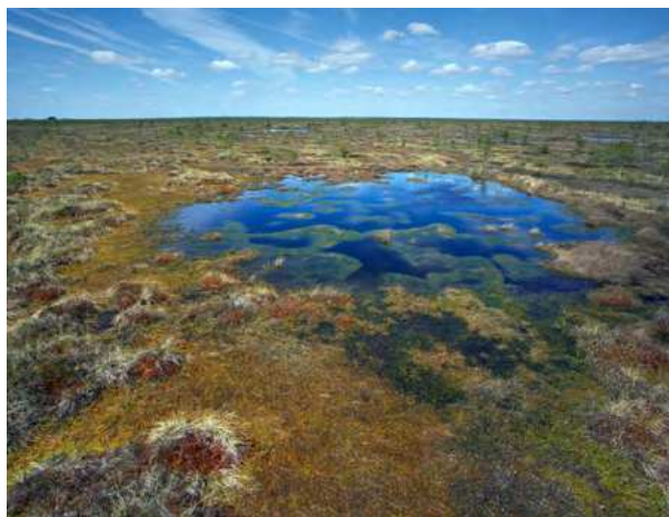
Author photo: A. Kolotilin