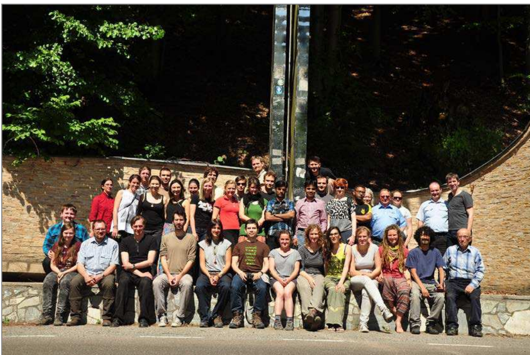
Figure 1: Group picture of our last student excursion in June 2015 at Geographical Centre of Europe, close to Rakhiv.